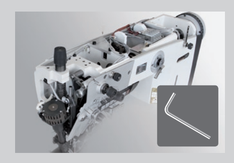
Unique service concept:

Easy and fast access to all adjustments. The top arm cover and the head cover can be removed after loosening just 3 screws