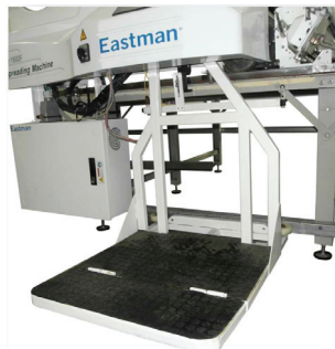
OPERATOR RIDE-ALONG PLATFORM